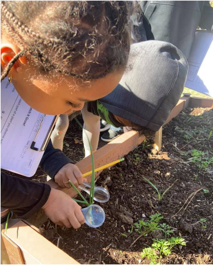
Washington Elementary School, Fayetteville

In a farm to school program, students participate in educational activities related to agriculture, food, health, or nutrition, which can take on many different forms. Nutrition education can happen through hands-on lessons in a school garden or in the classroom. Schools may utilize curriculum tailored to teach healthy nutrition while providing take-home recipes for children to try with their family. Educational opportunities can also happen in the cafeteria by conducting taste tests of locally grown fruits and vegetables and providing learning materials that enhance children’s understanding of the foods they are consuming.