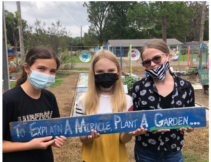
Hope Academy of Public Service, Hope