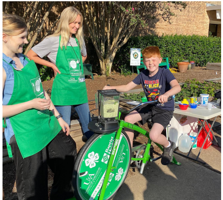
Central Elementary School, Van Buren

In October 2021, the Arkansas Farm to School Month theme was "Connecting Schools, Farms, and the Community to Local Food." To connect students to local