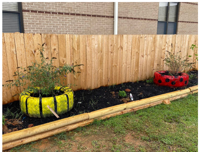
Stagecoach Elementary, Cabot