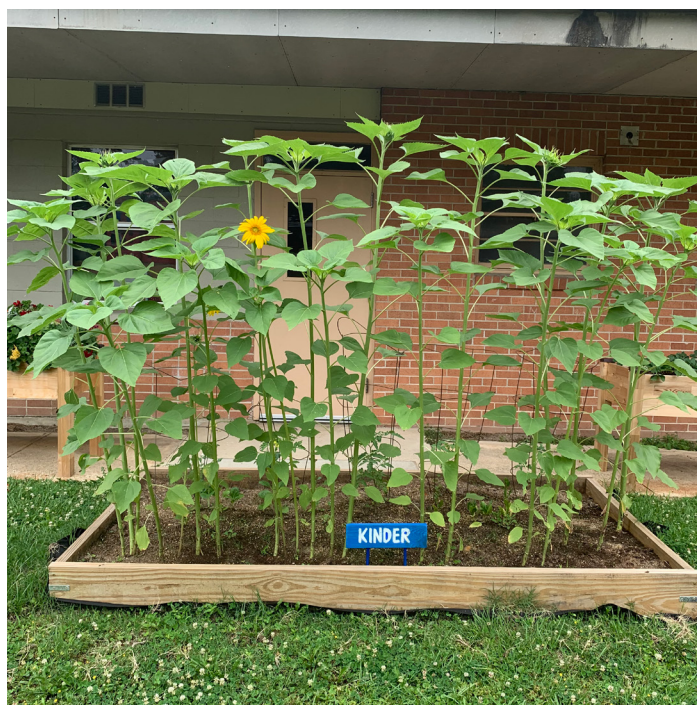
Hugh Goodwin Elementary, El Dorado

The Arkansas Department of Human Services Health and Nutrition Program will remain focused on feeding healthy and nutritious meals to children. It has increased outreach in rural areas and aims to increase engagement with current sponsors and the community using informational flyers and brochures. It will continue to provide exceptional support to the feeding program sponsors and looks to streamline the onboarding process. Lastly, it will continue to collaborate with partners by cross promoting information to the staff via e-newsletters and other social media outlets and will continue to identify farm to school partners within the Division of Child Care and Early Childhood Education. It has distributed over $5 million dollars of reimbursement to SFAs and CACFP operators due to the COVID-19 pandemic.