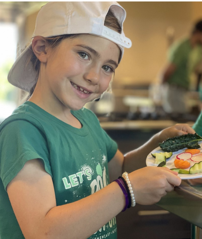
Apple Seeds, Inc., Fayetteville

The University of Arkansas System Division of Agriculture (UADA) Cooperative Extension Service Local Regional and Safe Foods Team created resources and offered virtual options for workshops and trainings in order to provide outreach and education to farmers, clients, and stakeholders. The team published an information sheet on Fall Farm Activities and COVID-19 which gives up-to-date guidance to farmers in Arkansas on how to safely operate these cherished seasonal, family-oriented activities during the pandemic. This resource won a 2021 Outstanding Leaflet award from the American Society of Horticultural Science. Additionally, the team continues to maintain 8 webpages on COVID-19 for Arkansas farmers, small food businesses, agritourism, and other food system stakeholders. Additionally, the SNAP-Ed program has continued to provide nutrition education to schools during the COVID-19 pandemic. UADA Cooperative Extension Agents worked with schools to identify program delivery methods that fit within the safety guidelines specific to that school, based on local conditions. Agents have continued to provide gardening education outdoors as well.