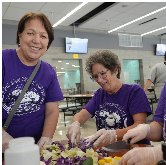
Fayetteville Public Schools, Fayetteville