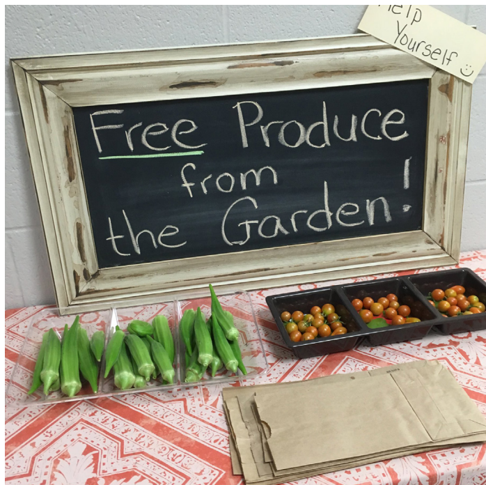
Pike View Early Childhood Center, North Little Rock

Schools, early childhood education facilities, and alternative learning environments have the opportunity to serve local foods to students. Local foods can be served in the classroom, cafeteria, or other locations depending on the structure of the learning environment. United States Department of Agriculture feeding programs such as the National School Lunch Program, Child and Adult Care Food Program, and Summer Food Service Program, as well as food service programs