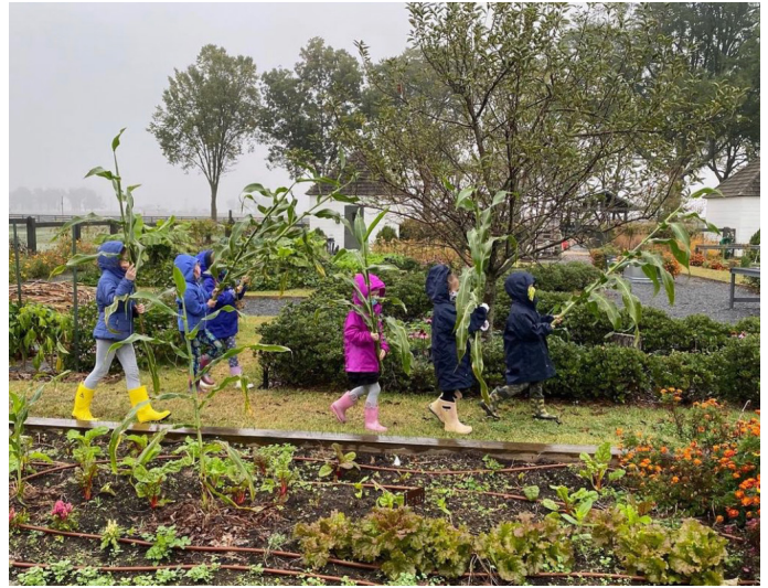
The Delta School, Wilson

Schools, early childhood education facilities, and alternative learning environments all play a critical role in providing students with avenues to increase their knowledge of how food is grown and produced, their understanding of the importance of healthy, nutritious food to their health and development, and their ability to make healthy food and beverage choices.